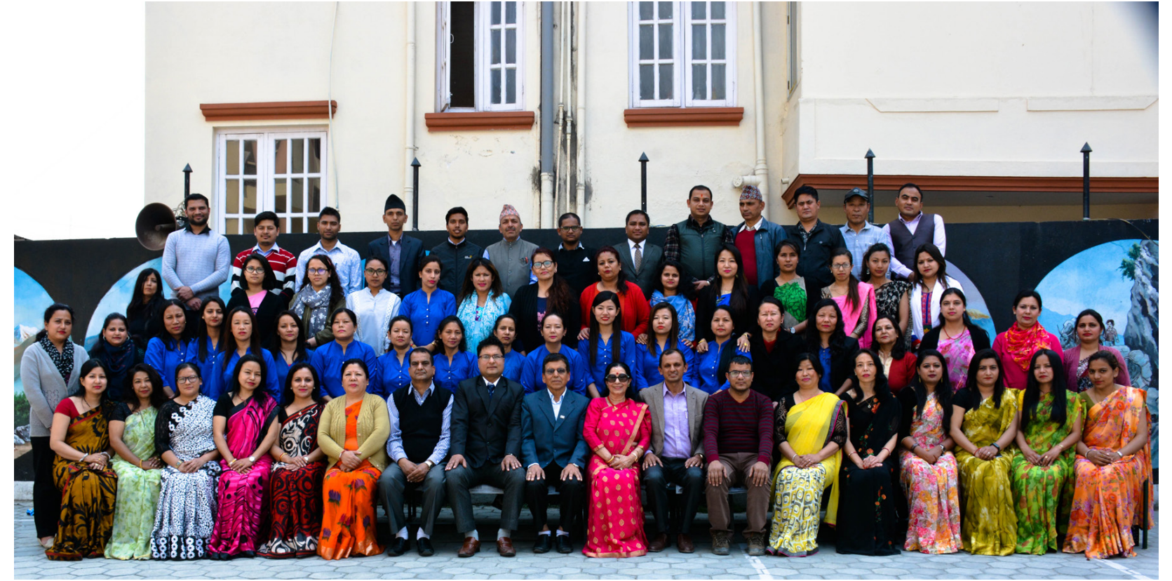
OUR CORE TEAM Sitaula Group